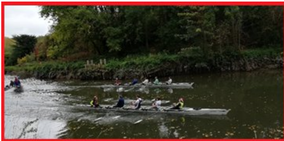
The Ariel and Linden teams with follow-up boat behind

** Linden Ruderverein visited their partners Ariel Rowing Club in Bristol from October 17-19 and had a packed programme.