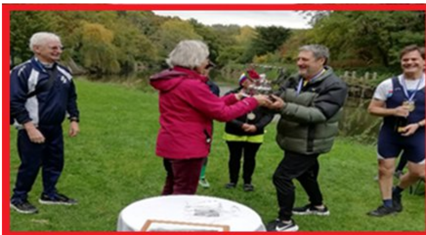
The Chattock Fours cup presentation

A reception on the Friday evening with the reopening of the historic Avery's boathouse, was followed on the Saturday by several races on the river, including the resurrection of the club's Autumn Regatta, the Chattock Fours.