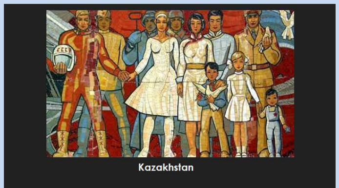
Poster from Kazakhstan

[Among] examples of particular interest [are] those from the German Democratic Republic. These show characteristics suggesting that the creativity that has put Germany at the forefront of contemporary art was evident on both sides of the border.