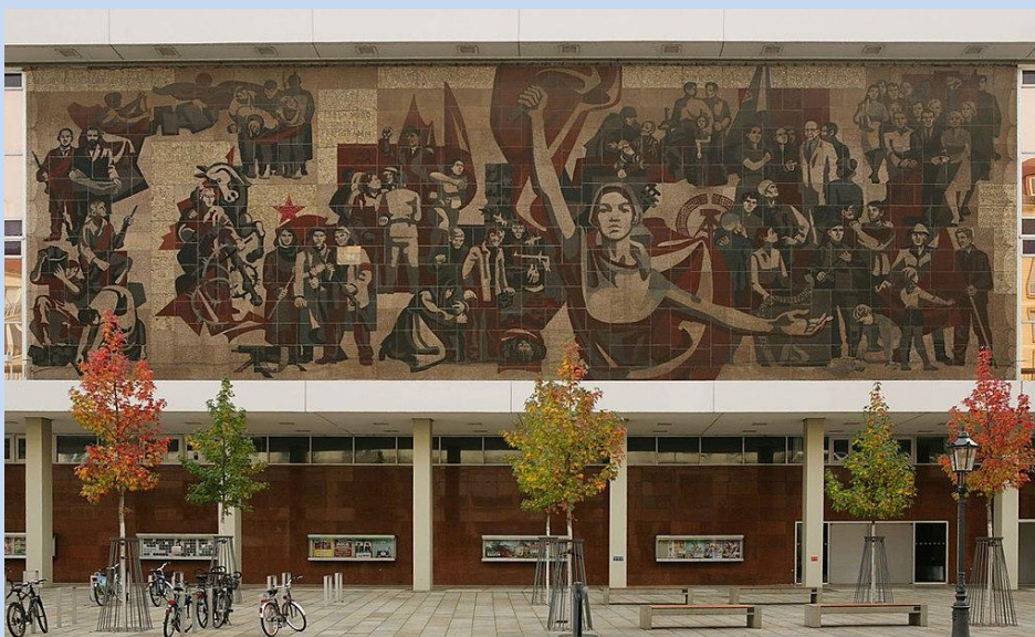
Way of the Red Flag, Dresden

[Among] examples of particular interest [are] those from the German Democratic Republic. These show characteristics suggesting that the creativity that has put Germany at the forefront of contemporary art was evident on both sides of the border.