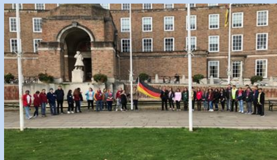
Outside the City Hall

The last week of October saw the second leg of the Erasmus+ funded project “Politik zum Anfassen” (Grasping Politics, as a loose translation?), where 20 young people aged 14-15 visited their partners in Bristol’s Youth Council, and had 3 days learning about the British political system. The Bristolians visited Hannover in May/June and learned about the German system, including the fact that in Germany, young people can vote in the local elections at 16 years old.