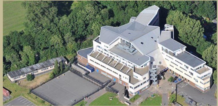
Fairfield School – “from above”

We made our way into a room with chairs of three and four grouped together and were joined shortly afterwards by the first “batch” of interviewers (there were two groups of interviewers). The students wanted to find out about our first impressions of Hannover and how things had changed over the years. The subjects also covered how things in Bristol had changed, together with similarities between the cities, both positive and negative. This was all part of the ‘Somebody Else’s Shoes’ anniversary project.